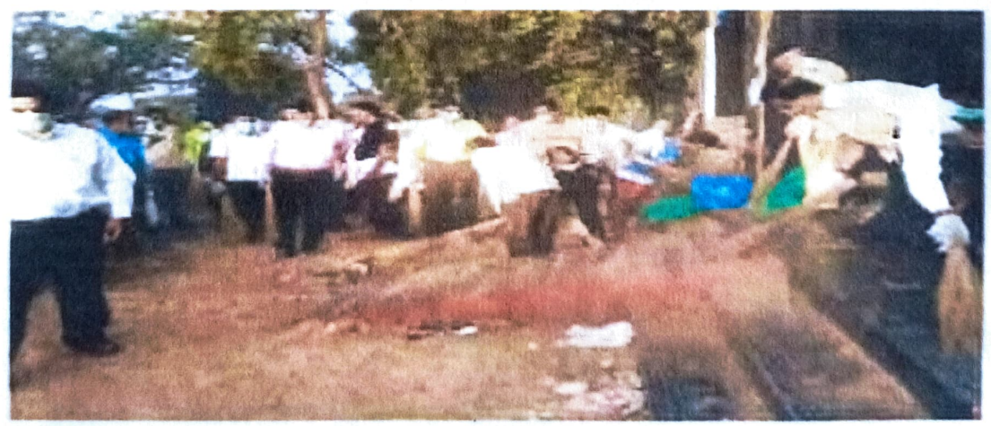
Plastic Waste Collection Programme