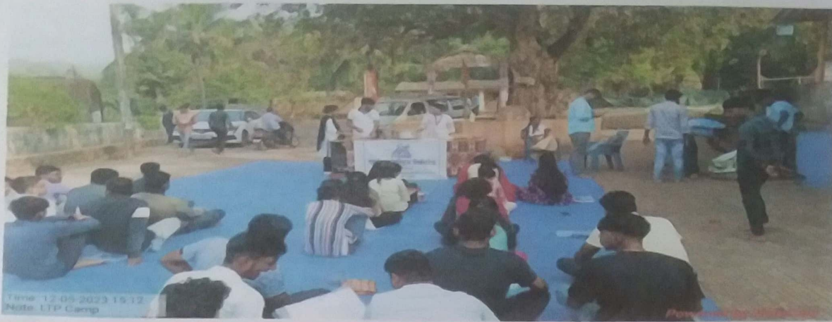
Figure 1. Skill and Talent Enhancement Programmes organized by the College: