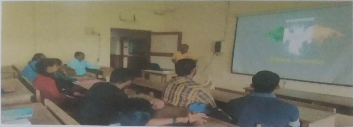
Figure 2. "Unleashing the Power of Research: Developing Faculty and Student Research Capabilities in College"